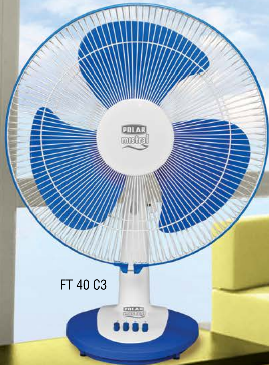
FT 40 C3