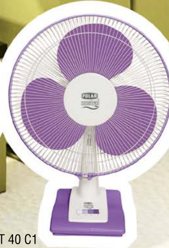
FT 40 C1