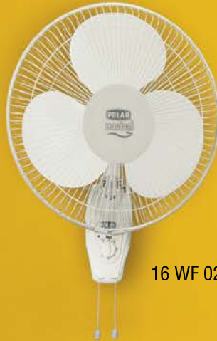
16 WF 02