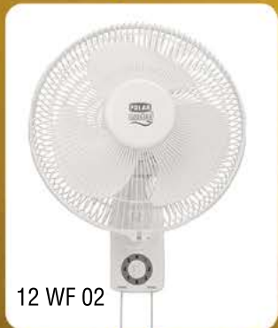
12 WF 02