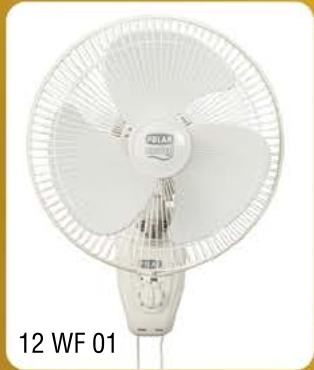
12 WF 01