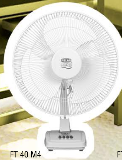
FT 40 M4