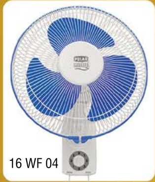
16 WF 04