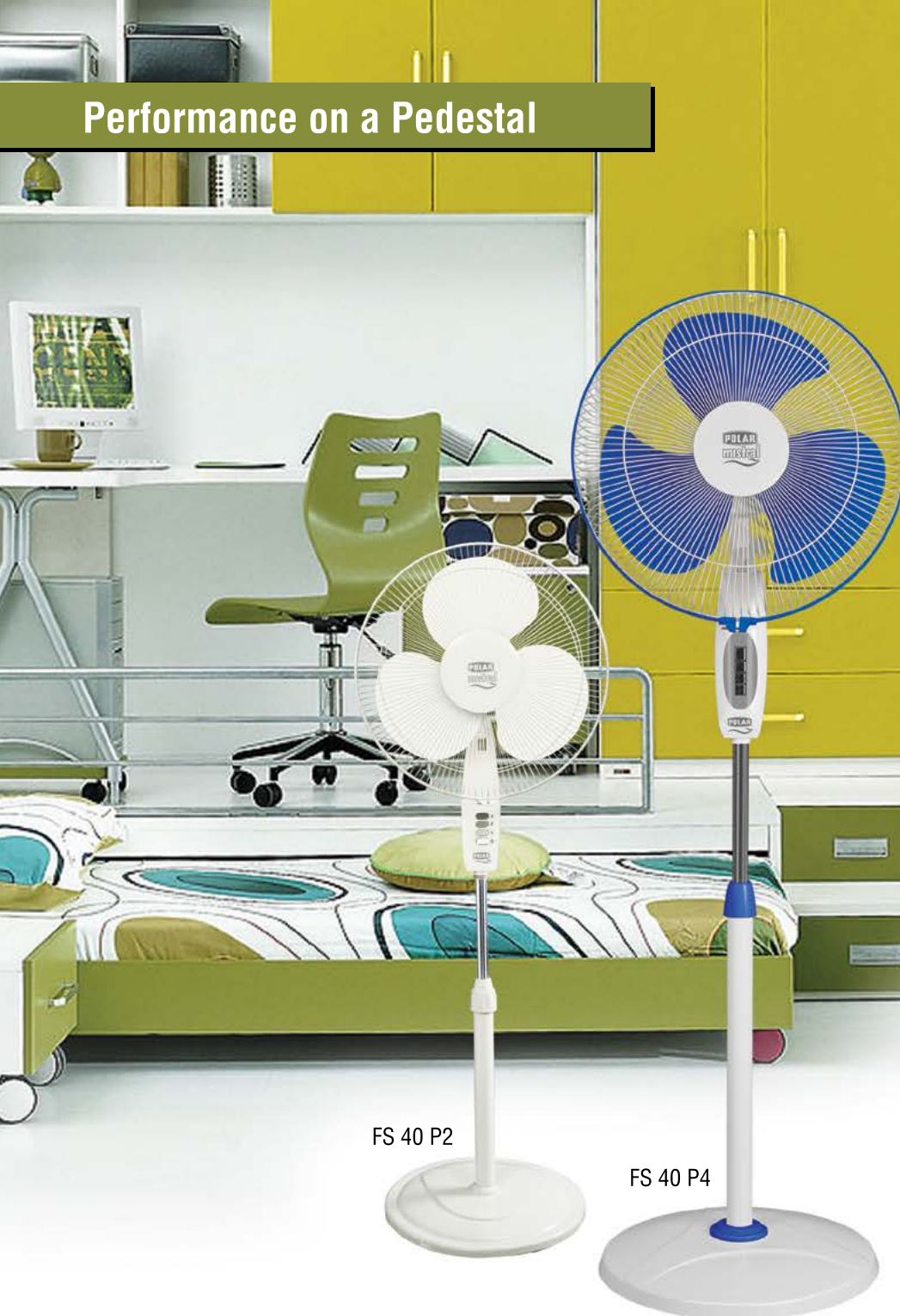
FS 40 P2